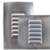
Satin Nickel (Metal)