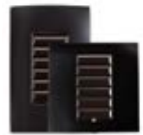
Venetian Bronze (Metal)

*Brown and Ivory are not available for 240V products.