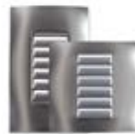
Stainless Steel (Metal)