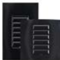
Midnight Black (Satin Finish)