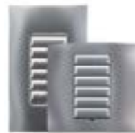
Aluminum (Satin Finish)