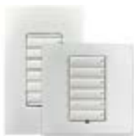
Snow White (Satin Finish)